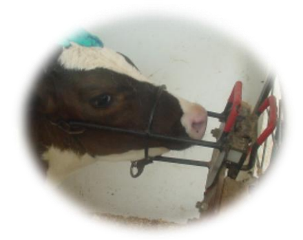
An example of proper head restraint