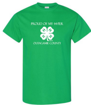
Adult sizes available S-5XL

If you're looking for a unique way to celebrate this year's Outagamie County Fair, we have Exhibitor t-shirts available. We also have a parent/grandparent/other significant person option as well. Below you will find two examples, one for the exhibitors (Growing with 4-H) and one for the adult/significant person(s) (Proud of my 4-H'er).