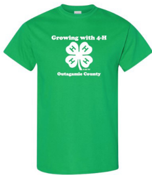
Youth sizes available S-L

$5/t-shirt for all Cloverbud members (please indicate the name of your Cloverbud in your order request)