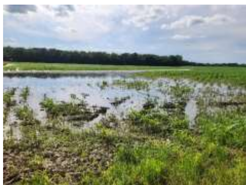
Flooded, Late Planted Corn Outagamie County