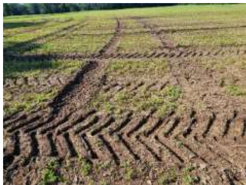
Damage to Alfalfa Following July Harvest